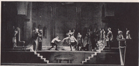
The Last Scene of "Hamlet"